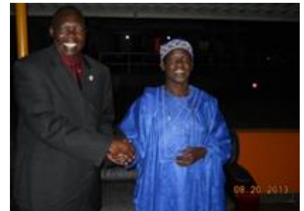
Meeting with the Vice President of the Republic of South Sudan. His excellency James Wani Igga

Yet, two years after independence, South Sudan faces serious development challenges, and many observers assert that it will take years to see sustained economic growth. The main challenges include the absence of good infrastructure and skilled labor. In the education sector, important progress has been made, however literacy rates remain low. It is possible for South Sudan to overcome these challenges if the government of South Sudan can diversify the economy to reduce over-reliance on oil revenues.